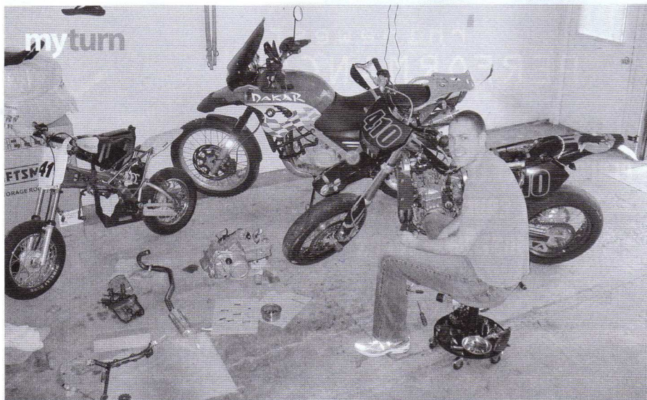
"It's not broken, I'm just making it better!"

away through some of the most treacherous terrain I have ever experienced, let alone with a fully laden motorcycle.