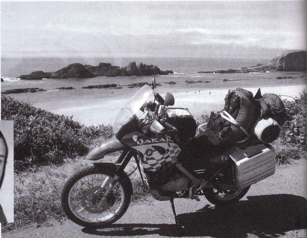
The first sighting of the Pacific Ocean.