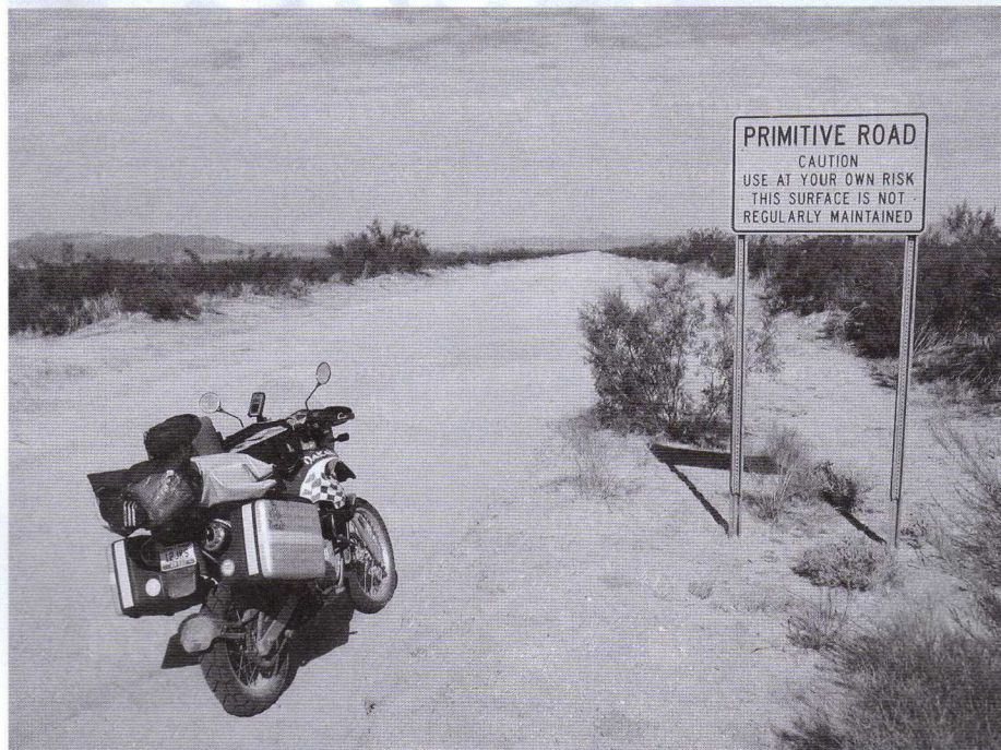
Full loaded over the road less traveled – Phoenix to Las Vegas.

My plans were confirmed as I never had to sleep in a hotel and I was able to finance the entire $1,430 cost of the trip just by twisting balloons. Heck, I even earned a $24 overall profit from my 11,882 miles on the road! And I learned NOT to drive too closely behind pickups and trailers loaded with anxious cows with full bladders and to be wary of female 30-some things who want to buy you a drink!