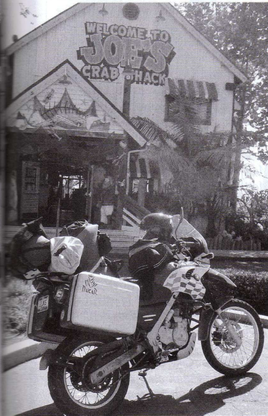
Ballooning across the nation.

As I was in search of dirt riding, too, I decided to travel from Phoenix to Las Vegas off road as much as possible. I soon found that these roads change into sandy paths that ended in a newly formed lake due to unusually large amounts of summer rain. Not wanting to backtrack 50+ miles of terrible desert terrain with a fully loaded bike, I headed towards a ranger station that was about 10 miles